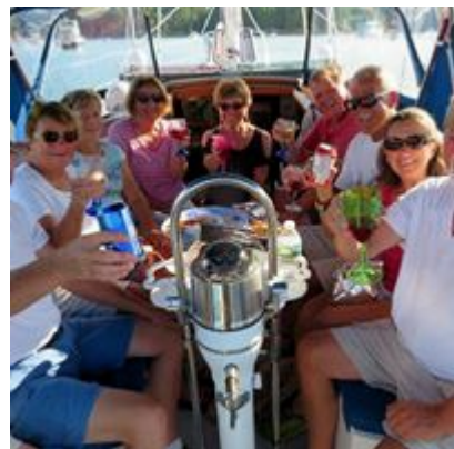
A cruise with Boating Club friends